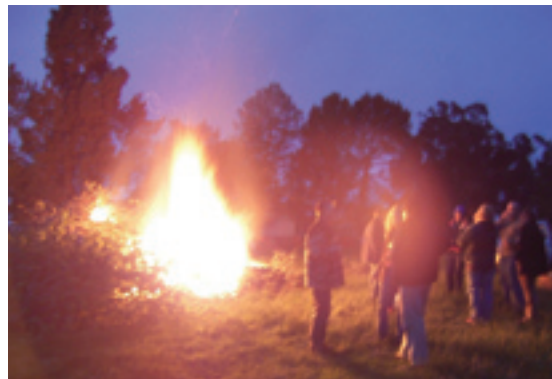
The team celebrate the end of pruning with a bonfire at the winery.